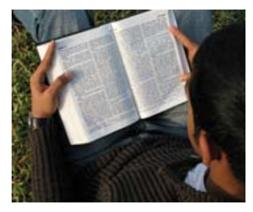
Guidelines for the lectio divina > 17