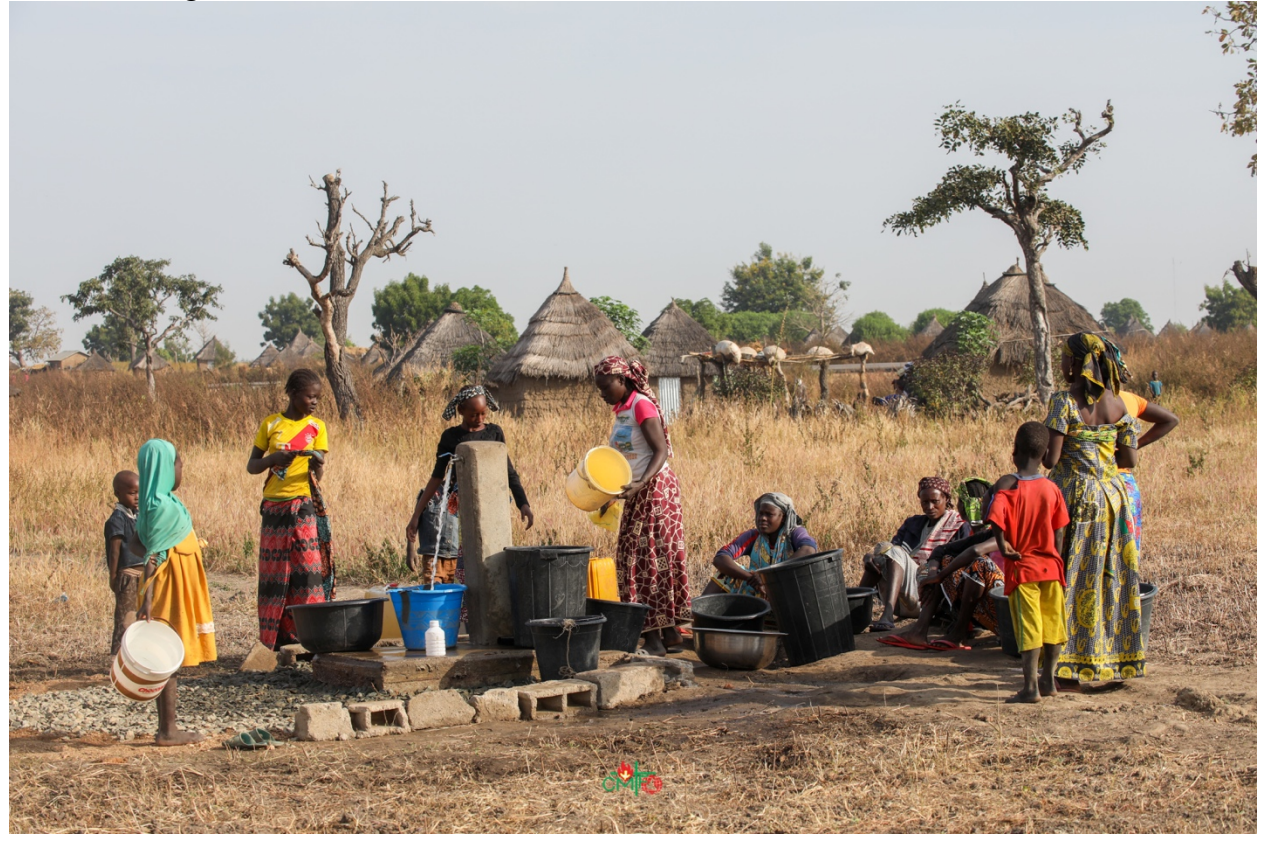
Claret Vida Picture 5: Water is Fraternity

E - EDUCATION wise, Clean Water helps keep kids in school, especially girls. Less time collecting Water means more time in class. `