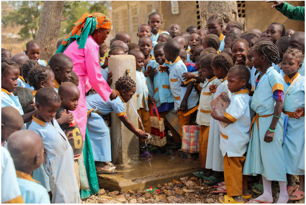
Claret Vida Picture 7: Water is Education