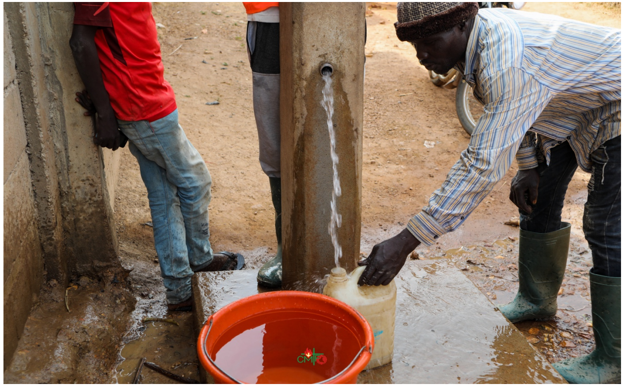
Claret Vida Picture 6: This is Clean Water