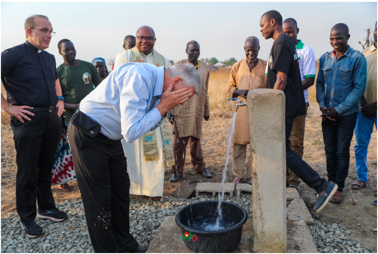
Claret Vida Picture 8: Water is Emmancipation