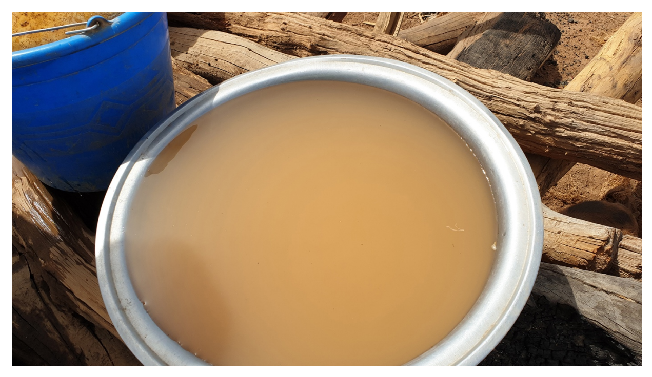
Claret Vida Picture 2: This is not TEA; this is water