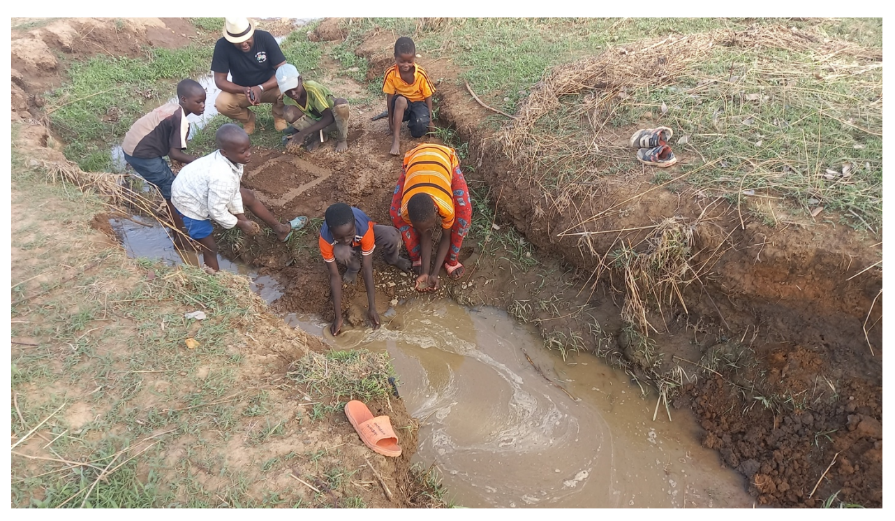
Claret Vida Picture 3: The source of life????

In the villages in our parish territory that attracted our curiosity since our arrival in this almost forgotten part of Cameroon, water is so scarce. If during the rainy season, which lasts only 3 to 4 months in the year, the population can collect water as it can, in the dry season it becomes very scarce and undrinkable. Many diseases are observed in this area because of the consumption of river and lake water. This explains our motivation to direct our very first project towards the realization of boreholes and overhead water tanks to thus contribute to relieve the social pain of the people.