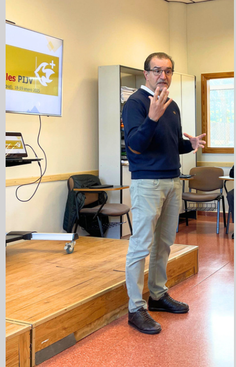
Photo of PJV of Santiago