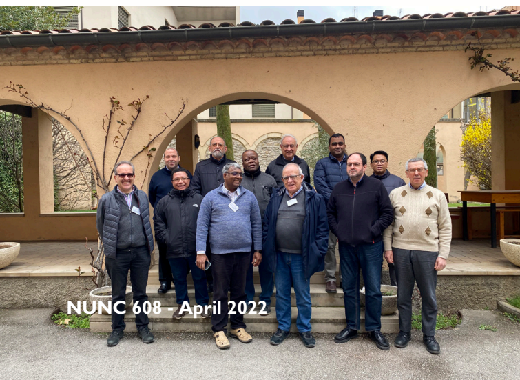
NUNC 608 - April 2022

During the sessions facilitated by Pere Codina, CMF, they have looked upon the situation of the parishes and discerned the common path they shall take. They sought new approaches to a new Church style, new ways to work together as a Province.